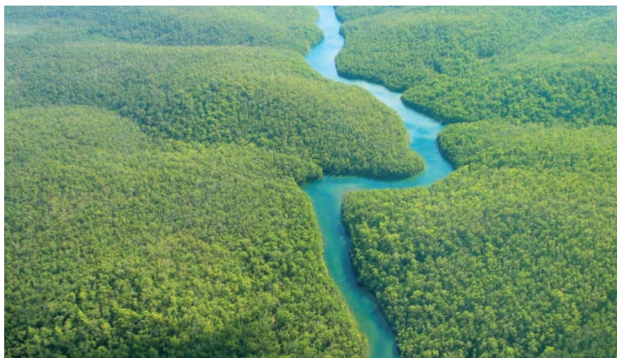
Amazon River, Peruvian Amazon