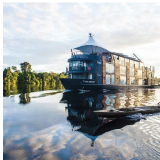
M/V Aria Amazon