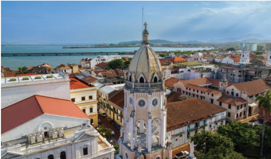
Old Town in Panama City, Panama