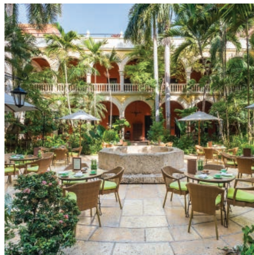
Sofitel Santa Clara