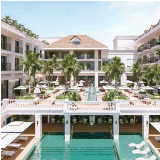
Sofitel Casco Viejo