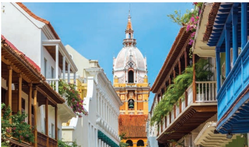
Old Town, Cartagena, Colombia