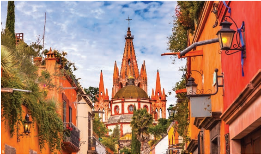
San Miguel de Allende, Mexico