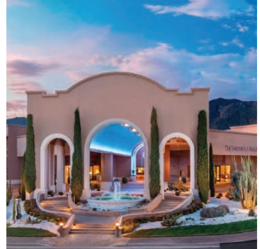
Westin La Paloma