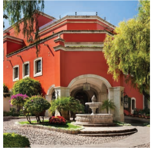
Rosewood San Miguel de Allende