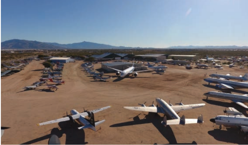
Pima Air & Space Museum, Tucson, Arizona