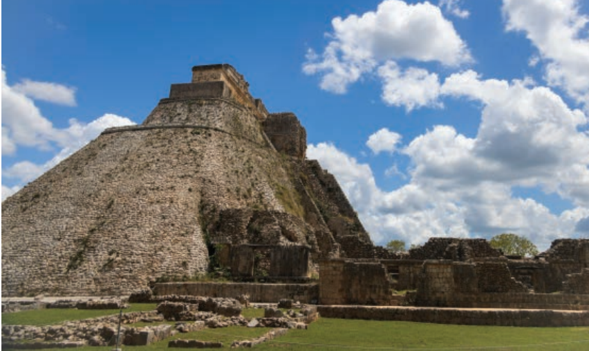
Uxmal Archaeological Zone, Merida, Mexico