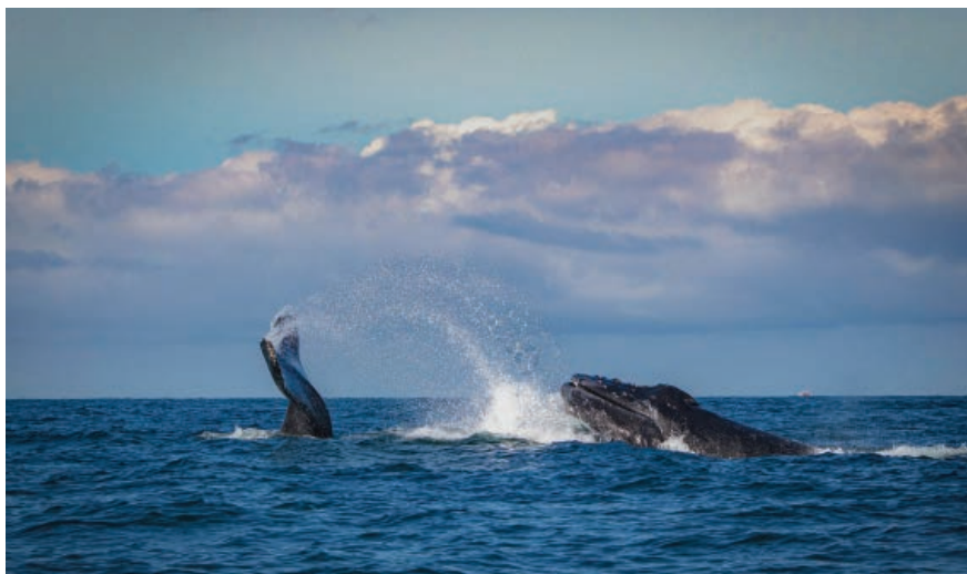
Humpback whales at the coasts of Puerto Vallarta, Mexico