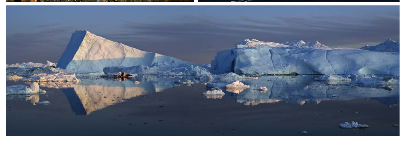
DAY 4: SATURDAY, SEPTEMBER 07