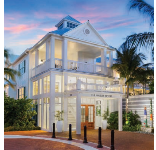
The Marker Resort