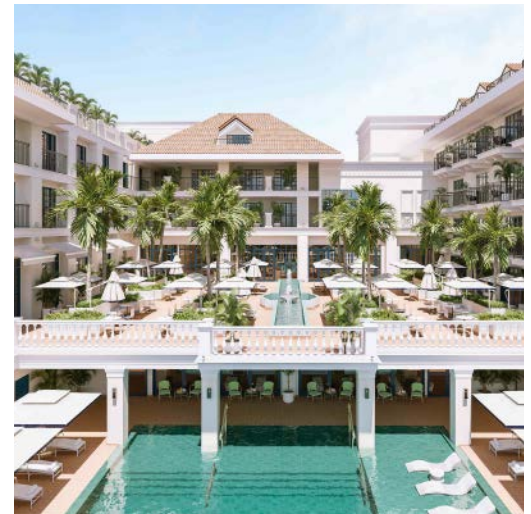
Sofitel Casco Viejo