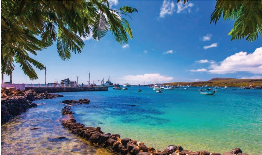
San Cristobal Island, Galapagos Islands, Ecuador