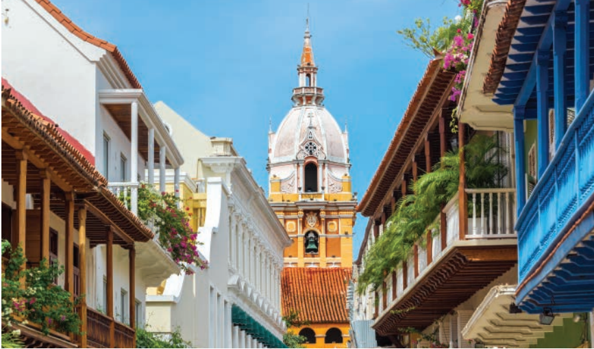
Old Town, Cartagena, Colombia