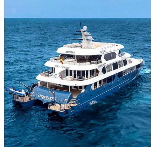
Bartolome Island, Galapagos Islands, Ecuador