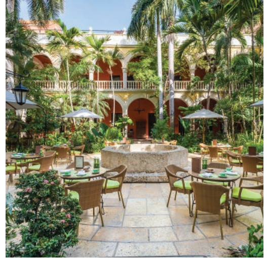
Sofitel Santa Clara