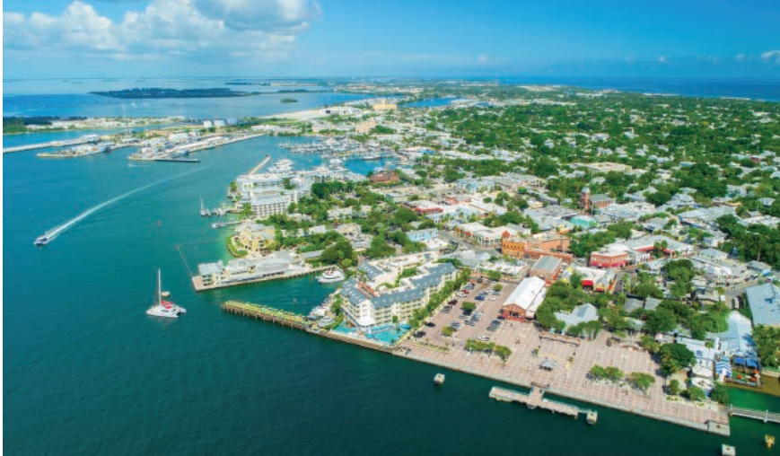
Key West, Florida, USA