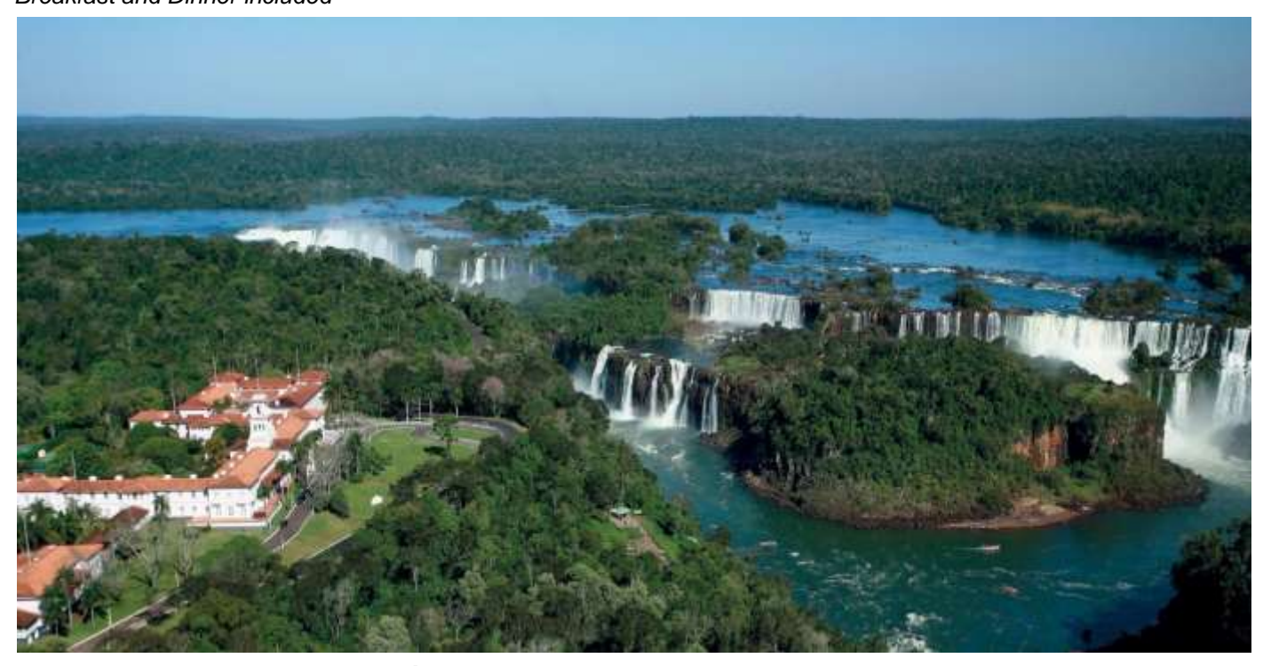
Day 30 - Thursday, March 17: Iguazú Falls, Brazil

Hotel: Hotel das Cataratas Breakfast and Dinner included