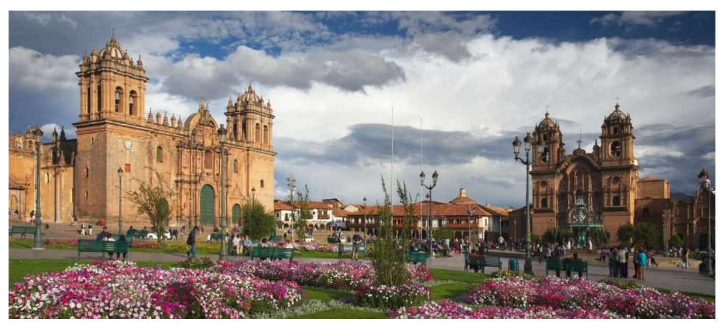
Day 7 - Tuesday, February 22: Cusco, Peru

Hotel: Hotel Monasterio Breakfast and Dinner included