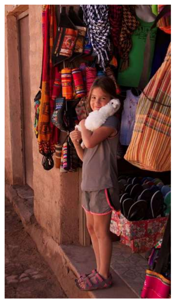
Day 15 - Wednesday, March 2: Santiago

Hotel: Tierra Atacama Breakfast, Lunch and Dinner included