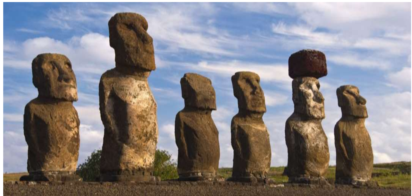
Day 17 - Friday, March 4: Easter Island, Chile

Today we will explore Easter Island, one of the most isolated islands in the world but 1,200 years ago a double-hulled canoe filled with seafarers from a distant culture landed upon its shores.