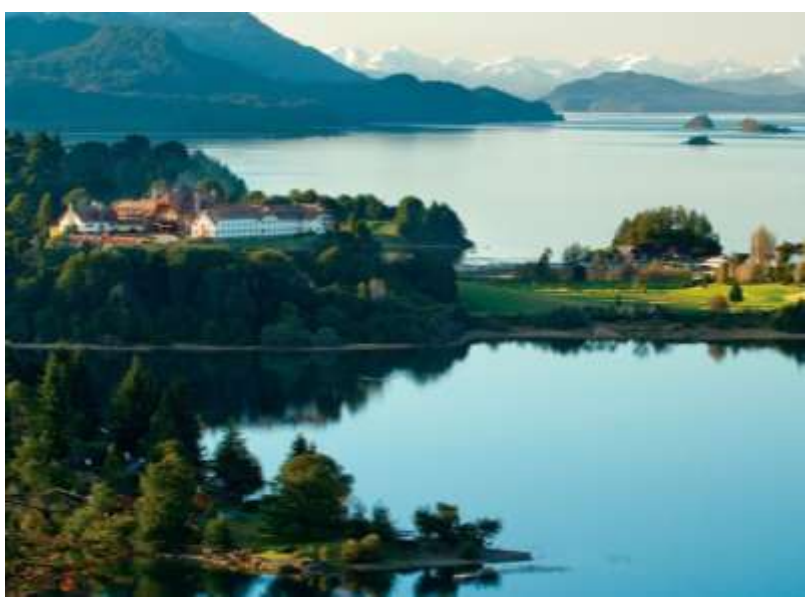
Day 24 – Friday, March 11: Puerto Natales, Chile (SCNT) → San Carlos de Bariloche, Argentina (SAZS) 635 Nautical Miles

Fly to San Carlos de Bariloche, a city that stands out for its architectural features and for being located in a privileged region due to the beauty of its landscapes made up of mountains, woods, lakes, glaciers and an exuberant flora.