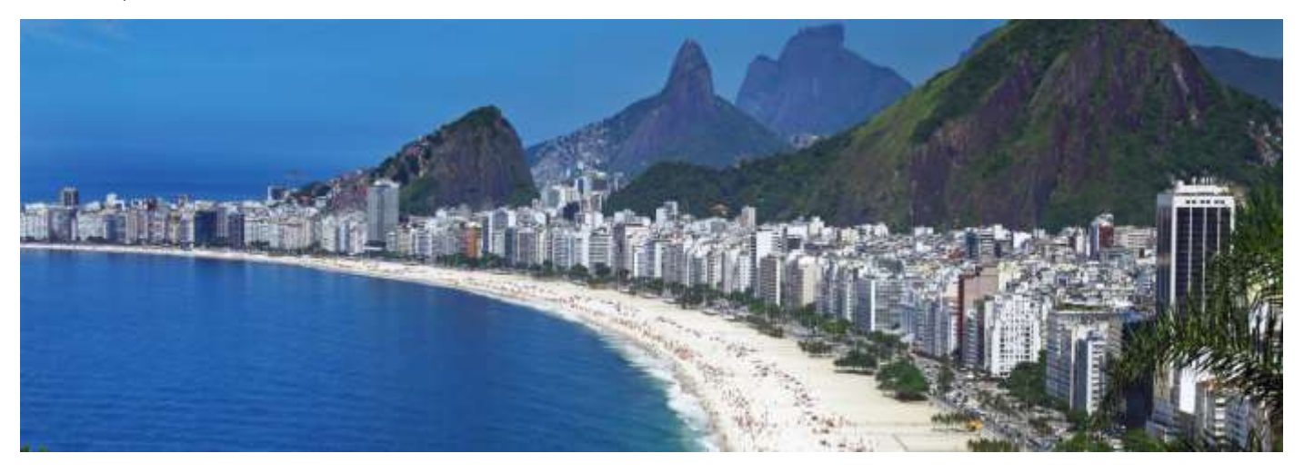
Day 33 - Sunday, March 20: Rio de Janeiro (SBGL) → Salvador da Bahia, Brazil (SBSV) 655 Nautical Miles

Hotel: Copacabana Palace Breakfast, Lunch and Dinner included