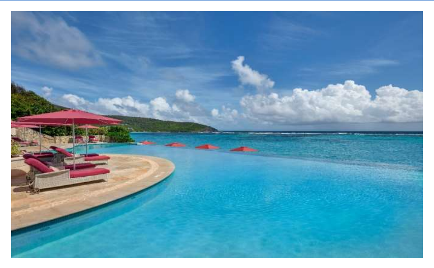
Day 38 - Friday, March 25: Canouan

Today is at leisure to relax on the beach or hop into a golf buggy or on a bicycle (available on rent) - navigate around the native tortoise species and see if you can find the old Anglican Church that was transported to the island centuries ago.