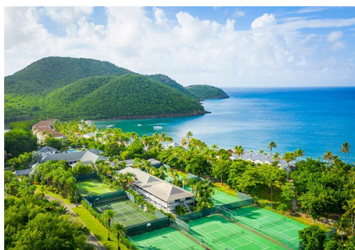
Carlisle Bay 3 Night Stay