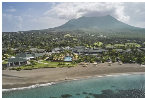
Four Seasons 3 Night Stay