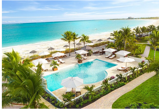
Seven Stars 3 Night Stay